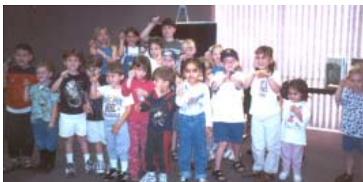
Kids at Slidell show off their finger caterpillars at Astonishing Afternoon